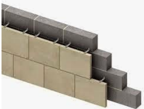
Fig. 2 The gab behind stone and wall

Despite the end of his role as a building material, natural stone in all kinds of Stone, Marble and Granite it's still considered the most material choice among architects, because of its natural beauty and lack of need for maintenance, stone material has become produced for purpose of the cladding walls in the form of slabs has a small thicknesses. Previously stone used as stone load-bearing instead of columns. In case of building stone, it's usually use the common two ways the traditional one or the mechanical way, and both of each way has its own advantage's and disadvantage, and both ways were used for aesthetic, and strengths to have long life. As well as increases the use of buildings for a long term in addition to its ability to withstand the vagaries of the weather and the weather, this contributes to the whole subject of sustainability. The mechanical way has another name, which it's called as Dry Fixing System, because in this case there is no any concrete between building stone and walls, which is consider as an advantage point in conditioning system, as shown in fig. 2