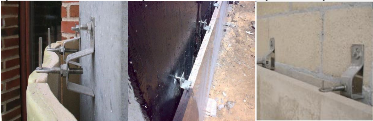
Fig. 5 show some different connecting tools

Mechanical methods has some special and perfect specifications, such as the points mentioned down. fig 6 show mechanical way, with decoration stone.