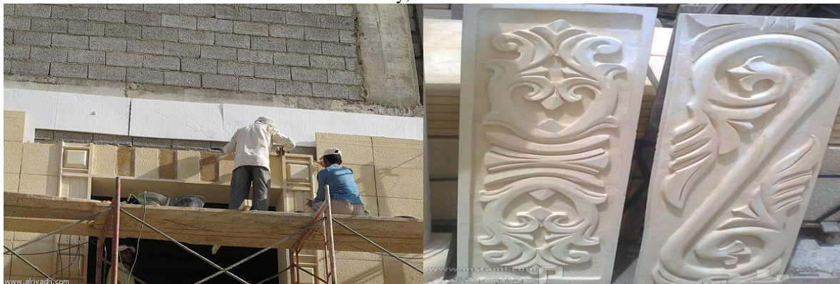
Fig. 6 show mechanical ways, with decoration stones.

Mechanical methods has some special and perfect specifications, such as the points mentioned down. fig 6 show mechanical way, with decoration stone.