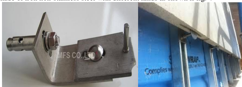
Fig. 4 the connecting tools non-stainless

While in the mechanical method, it features fast installation and easy maintenance work later, control the architectural design and aesthetic side, and thermal insulation of building. Special joints and connecting material use in the purpose of using mechanical method's, and in all applications all of these tools and materials, which is supposed to be made of iron non-stainless steel with different kinds as shown if fig. 4